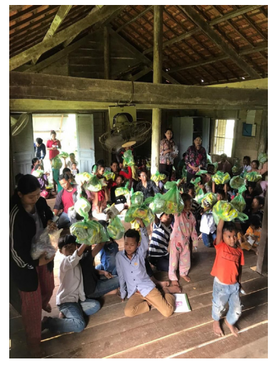
Deanery of Cambodia during a Food Relief session at Ksart Borei, Pursat

For the Deanery of Thailand, a Task Force has initiated a project to distribute "Shared Love" Care Packs for members who have contracted the virus. Each care pack contains medication recommended by a public hospital to reduce the symptoms; medical supplies such as mask, hand sanitizer, and biohazard bags; as well as equipment such as oxymeter, thermometer, and ART kits that they can use whenever needed. The Task Force had also provided advice, such as the usage of the medication provided, self-care, and information on where to notify and register their infection so that they can receive timely information from the government and receive teleconsultation with doctors.